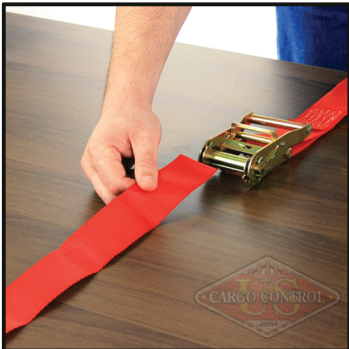
1) Insert loose end of strap into mandrel of ratchet