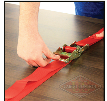
2) Open ratchet all the way