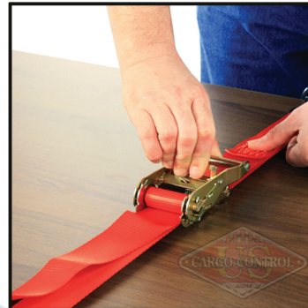
1) Pull trigger toward back handle