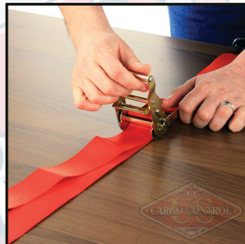
4) Crank the ratchet to desired tightening