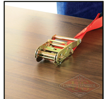
6) Close ratchet back down