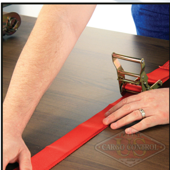
5) Make sure strap stays in line with other to avoid tangling/locking