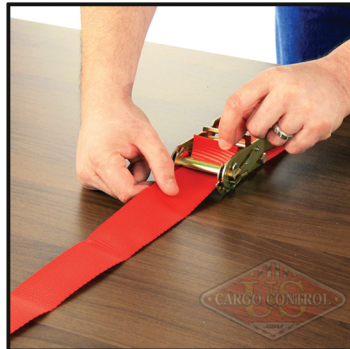
2) Pull strap through slot in mandrel