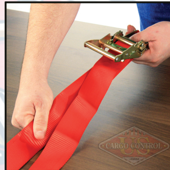
3) Webbing should release