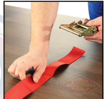
4) Pull webbing out of mandrel