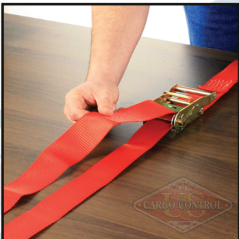
3) Pull slack out of strap to make strap tight